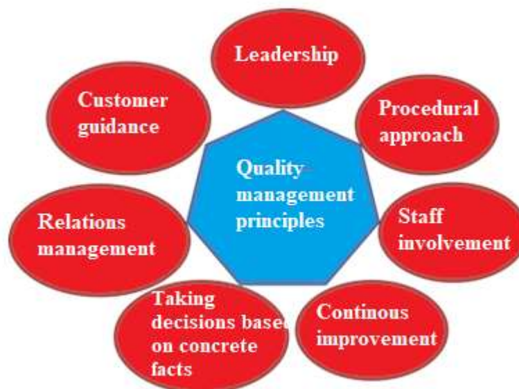
FIGURE 1 - QUALITY MANAGEMENT PRINCIPLES